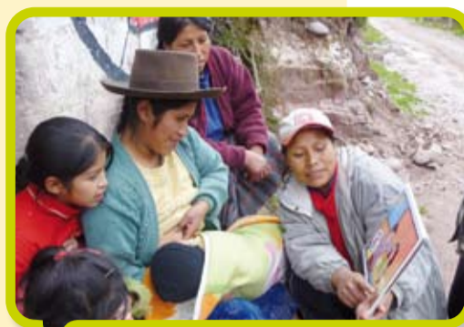
Breastfeeding for a healthy future.