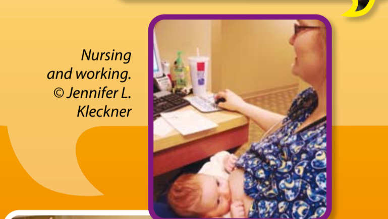
Nursing and working.