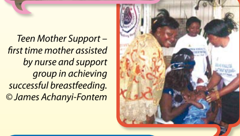
Teen Mother Support – first time mother assisted by nurse and support group in achieving successful breastfeeding.