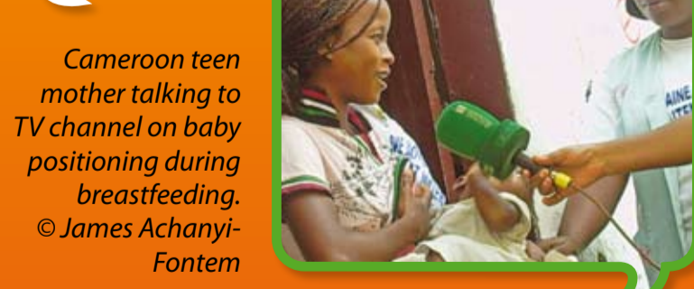
Cameroon teen mother talking to TV channel on baby positioning during breastfeeding.