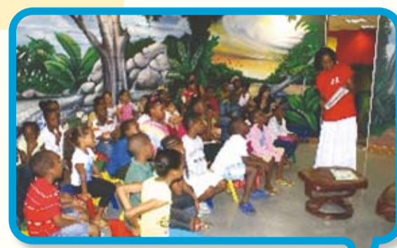
Taking Breastfeeding Awareness to the next generation with Art. © Lynette Sampson