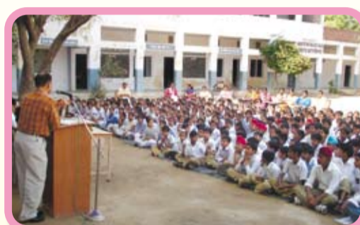
Breastfeeding Education Campaign in School.