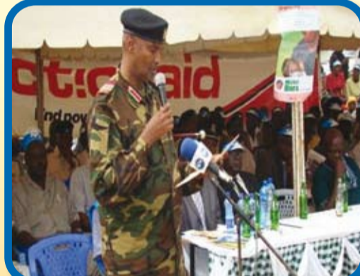
District commissioners remarks on the Importance of exclusive breastfeeding during the World Breastfeeding Week launch.