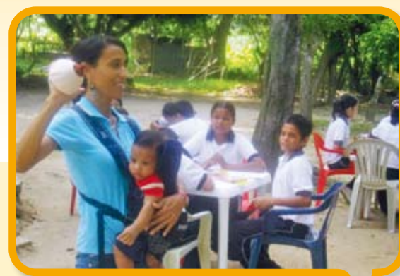
The present and the future is in our children. Educating children on breastfeeding and the environment.