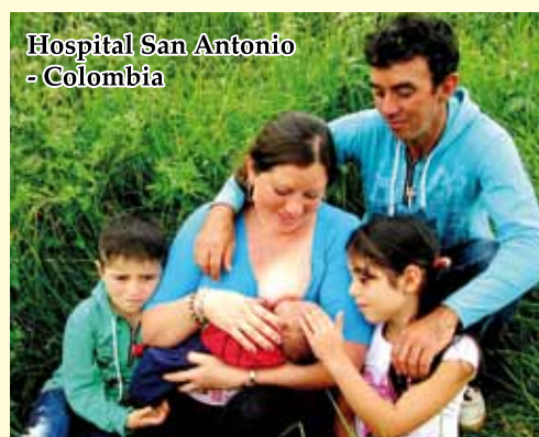
Hospital San Antonio - Colombia