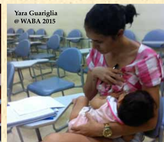
Winning photos from the World Breastfeeding Week 2015 Photo Contest.