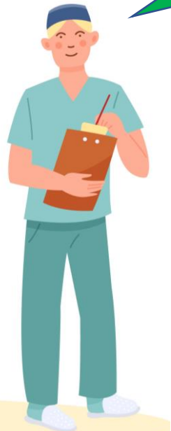
Designed by Freepik

Implement the revised BFHI 2018 guidelines in all health facilities.